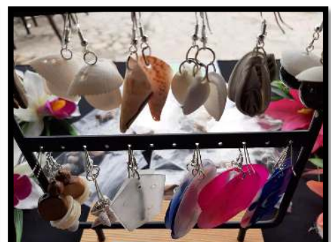
Taa Pera– Hair Sprays & Earrings